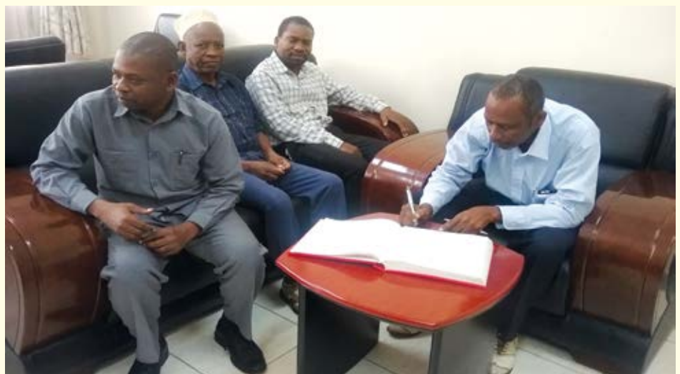
Zanzibar Examinations Council (ZEC) delegates sign a visitors’ book at NECTA’s office

The visitors were very impressed with the development at the Council and appreciated the time and the opportunity they had in learning new things. They hoped to use the knowledge when they returned to their offices.