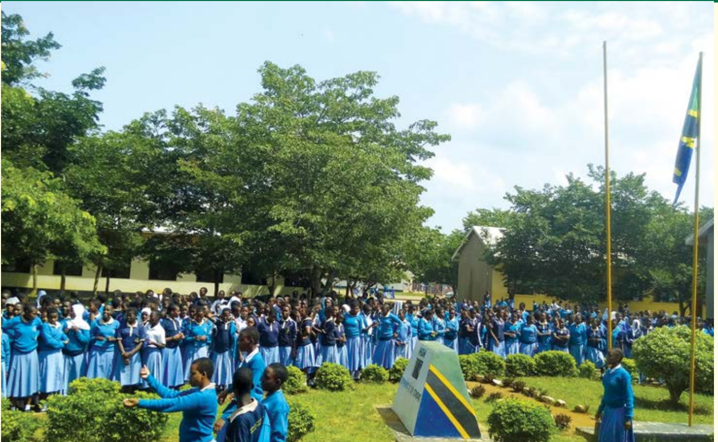
Nyankumbu Girls Secondary School students at the assembly ground

“It should also be noted that annual results for all subjects for each year are captured and stored into the system along with pupils’ particulars. NECTA is now in a position to retrieve instantly, national examinations registration data for Standard Four and Seven. In the past, NECTA used to collect registration data using fragmented systems installed to local unreliable and unstable machines from each district every year. The fragments of the systems are difficult to support, and it used to take about three months to complete registration; but with PReM, everything is simplified,” said Dr. Msonde.