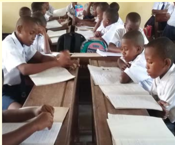
Mapambano Primary School pupils revise in a classroom

This problem might result in students receiving their Notification of Examination Results with different numbers or worse still, their photos can be mixed