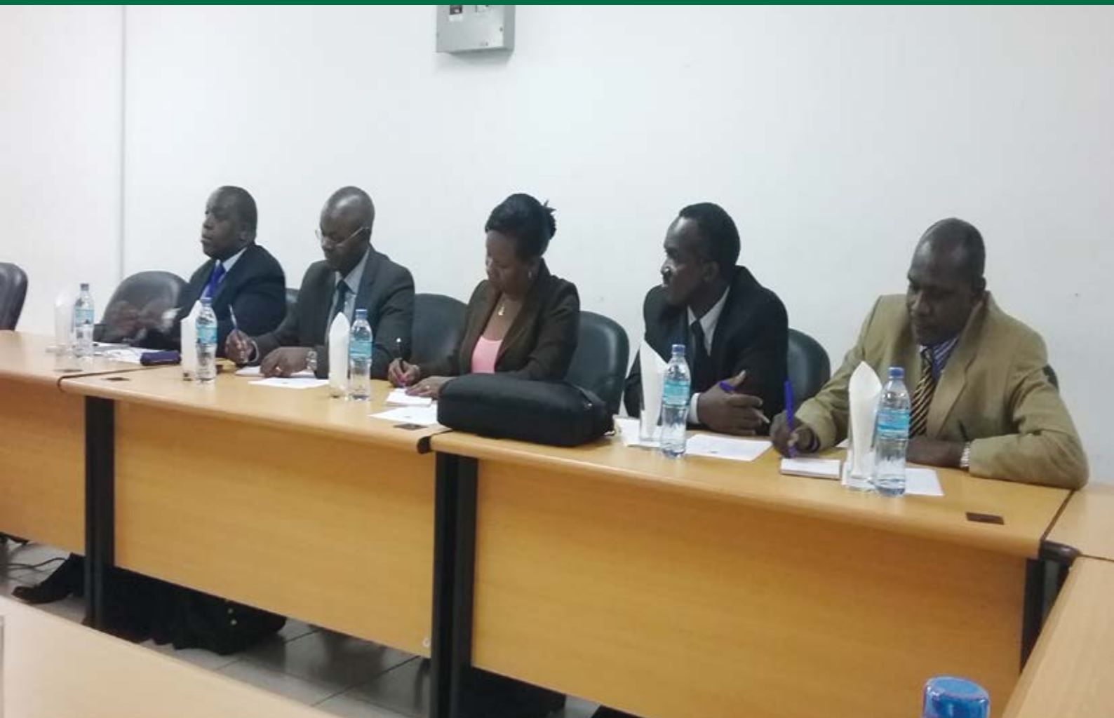
Uganda National Examinations Board (UNEB) delegates during a discussion with NECTA staff not in picture.

after a given period they are returned to the Council.