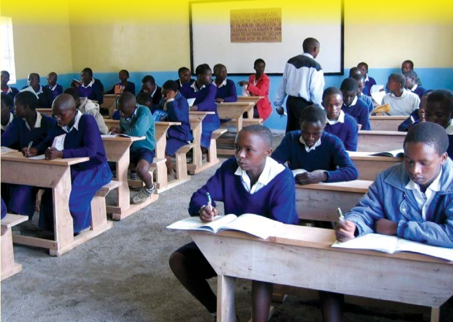
Primary School Pupils in a Classroom write notes

T he National Examinations Council of Tanzania (NECTA) has launched an information system known as Primary Records Manager (PReM). The system is used to capture and monitor pupils' progress records electronically, from all primary schools in Mainland Tanzania. PReM has three types of users. The first user is at the district level. This user interacts with the system by storing and managing the pupils' records at district level. The second user is at regional level, this user accesses the system by managing the pupils' records of their region. The third user is at the national level (NECTA), Ministry of Education, Science and Technology/ President's Office Regional Administration & Local Government . The user at this level is able to access the system at the national level.