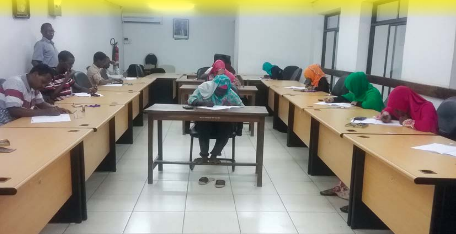
Students who study using Cambridge syllabus do their examination.

F oreign examinations mean, examinations prepared by examination authorities outside Tanzania for both foreign and local candidates residing in Tanzania. On its establishment, the National Examinations Council of Tanzania was legally given the mandate to work with and assist foreign examination boards in conducting their examinations in Tanzania.