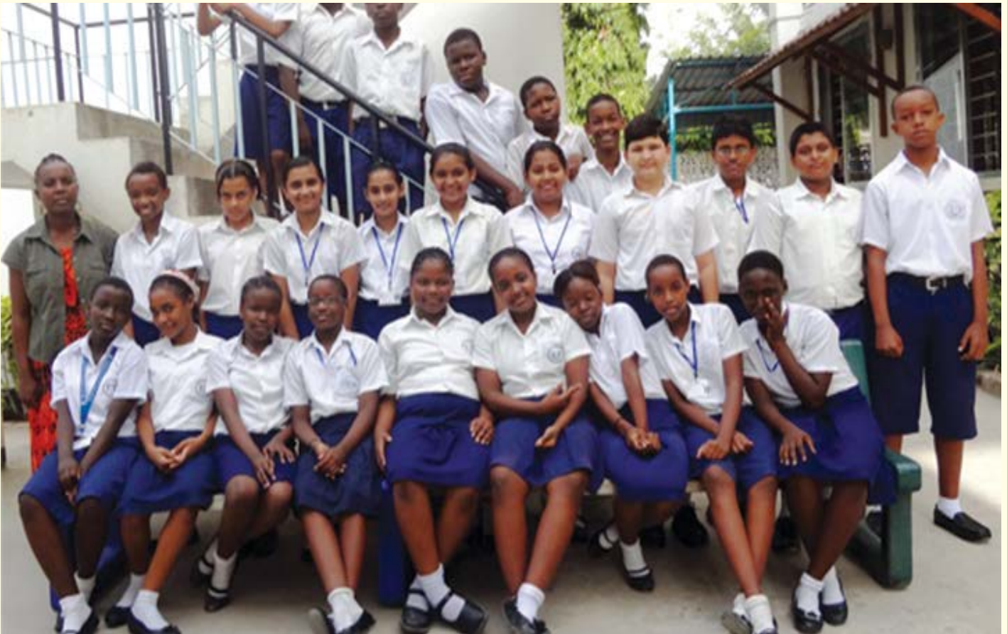
Primary school pupils who study using cambridge syllabus in a group photograph

This will affect students to apply for further studies (higher institutions of learning) or jobs since Universities cannot admit students who have not equated their secondary certificates and some employment agencies can not employ people who have not equated their certificates to the local examinations.