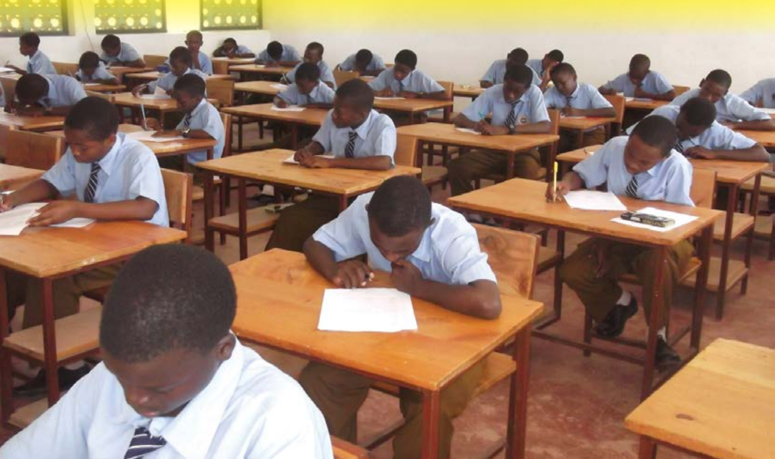
Libermann Boys' Secondary School during CSEE

The National Examinations Council of Tanzania (NECTA), conducted a research on the problem of discrepancy between the number of registered candidates to sit for Certificate of Secondary Education Examination (CSEE) and the actual number of candidates who sit for that examination. Basically, the number of registered candidates had been bigger than the actual number of students who sit for the examinations. This trend of discrepancies occurred for more than five years, from 2010 to 2015.