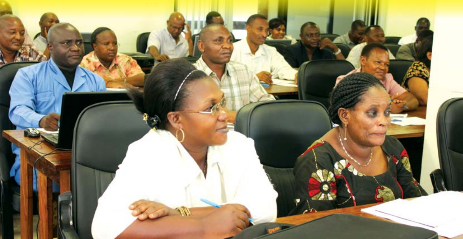
A section of Necta staff during one of item setting workshops

T he National Examinations Council of Tanzania (NECTA) organized a ten day workshop of examinations item on writing and editing from 17 th to 26 th July, 2017 at its marking centre at Mbezi Wani in Dar es Salaam.